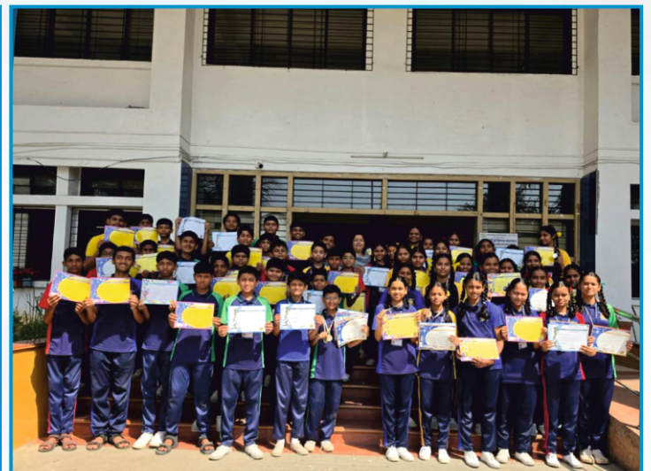
Olympiad Competitive Exam