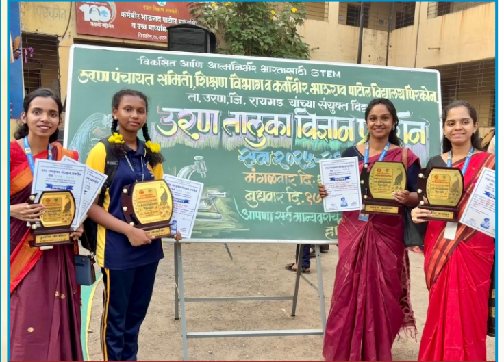
Taluka Level Science Exhibition