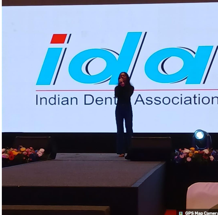
Mumbai, Maharashtra, India 🇮🇳 Block G, G Block Bkc, Bandra Kurla Complex, Bandra East, Mumbai, Maharashtra 400051, India Lat 19.064201° Long 72.867138° Saturday, 08/11/2025 12:33 PM GMT +05:30