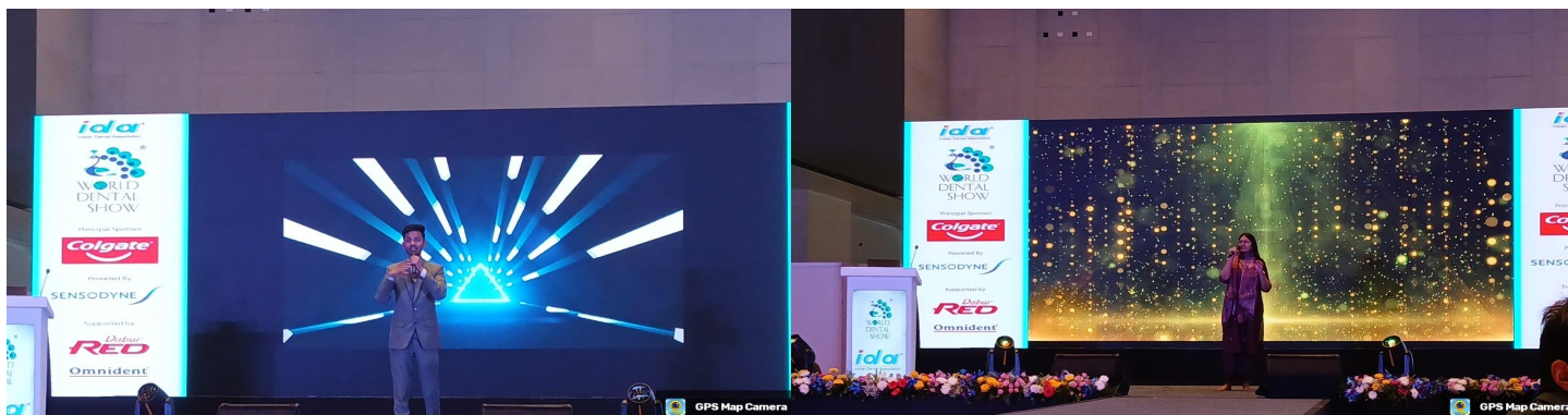
Mumbai, Maharashtra, India 🇮🇳 Block G, G Block Bkc, Bandra Kurla Complex, Bandra East, Mumbai, Maharashtra 400051, India Lat 19.064186° Long 72.86711° Saturday, 08/11/2025 12:50 PM GMT +05:30