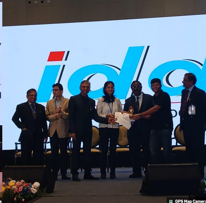
Mumbai, Maharashtra, India 🇮🇳 Block G, G Block Bkc, Bandra Kurla Complex, Bandra East, Mumbai, Maharashtra 400051, India Lat 19.064206° Long 72.867145° Sunday, 09/11/2025 05:10 PM GMT +05:30