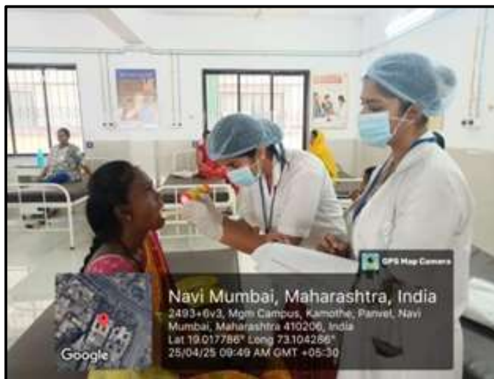
Clinical examination done by the dental team

among these patients. Oral health education and prevention strategies should be implemented in order to reduce the disease burden among these patients. Majority of the oral diseases are due to lack of proper health education of the patient and insufficient dietary intake. The various nutritional food items were informed to the children and their positive benefits were explained to them.