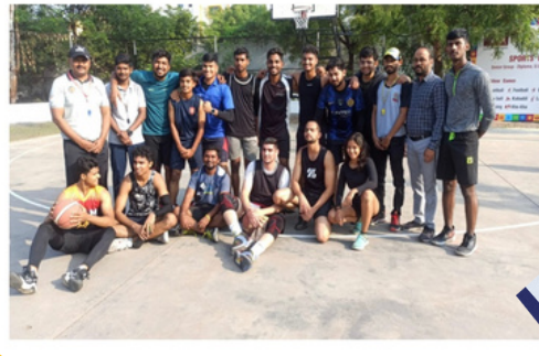
Basketball Boys (2nd position)