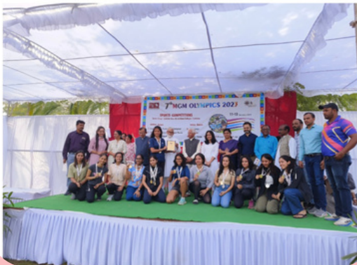
Basketball 1st position