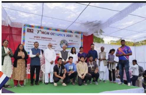
Badminton boys 1st position