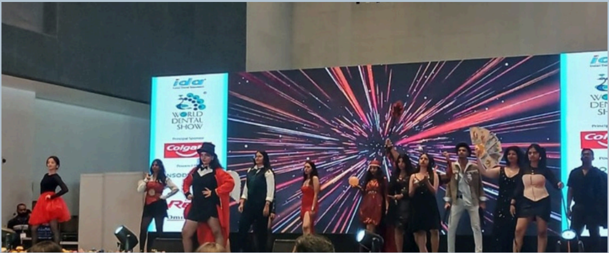
2nd Prize in Fashion Show