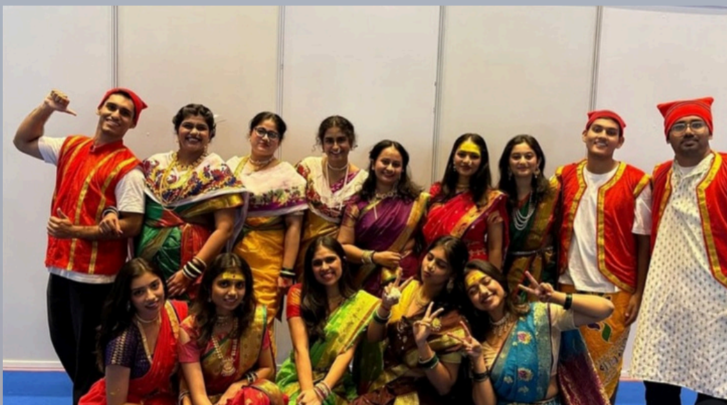
1st prize in Groups Dance