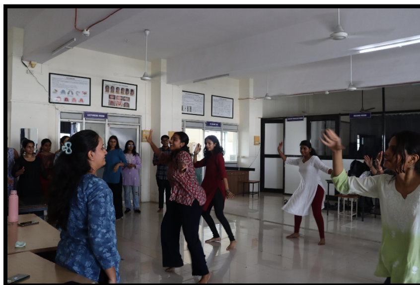
The Dance Workshop