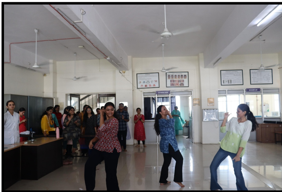
The Dance Workshop