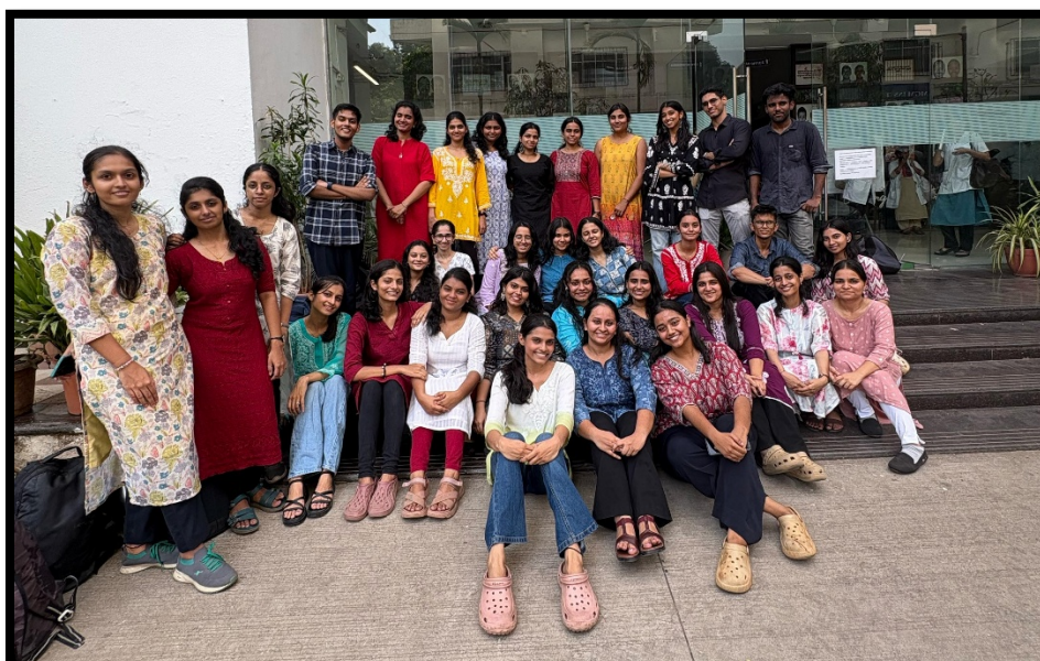
The Participants for the Dance workshop