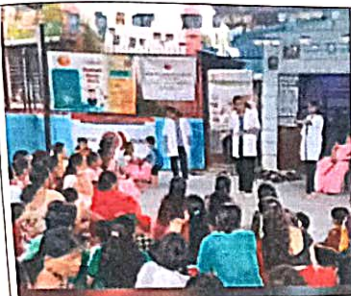
Nutrition awareness program