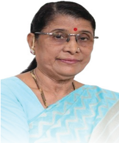
Hon'ble Sau. Shakuntala Ramsheth Thakur