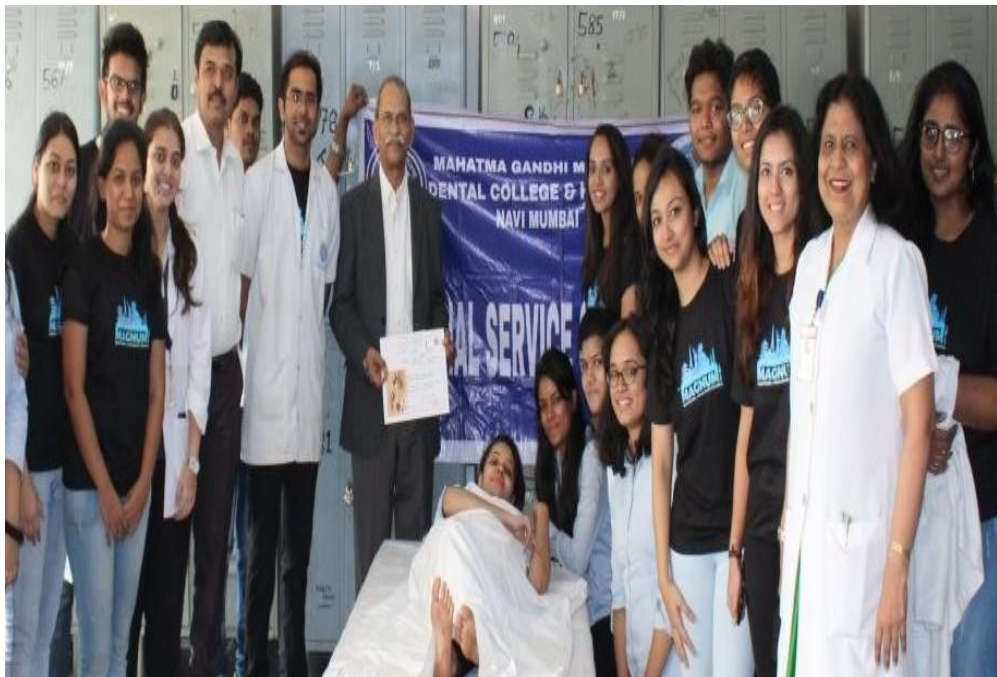
CHAIRMAN SIR, DEAN MAAM AND STIDENT WITH DONORS