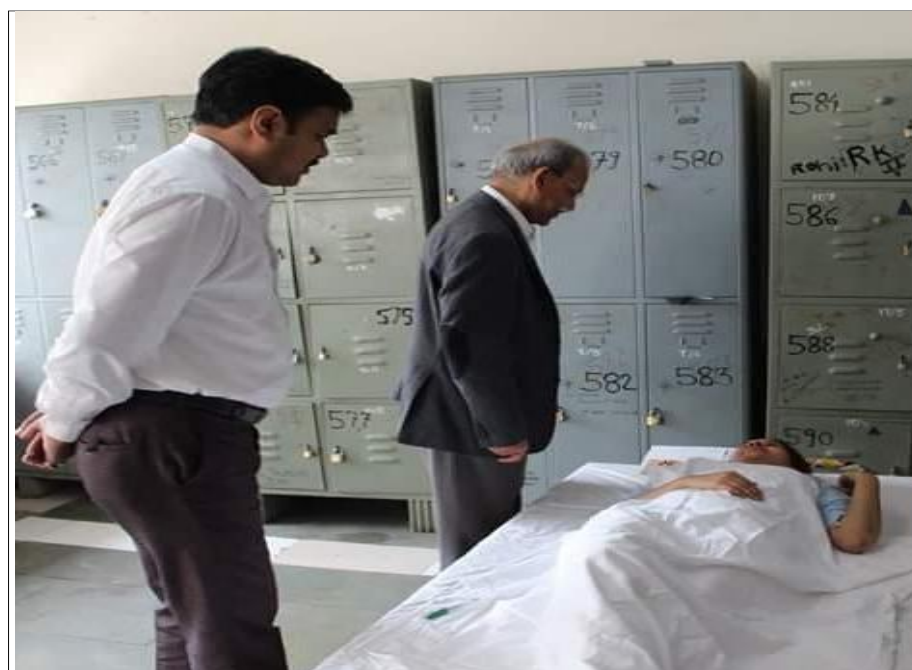
CHAIRMAN SIR SPEAKING WITH A DONOR