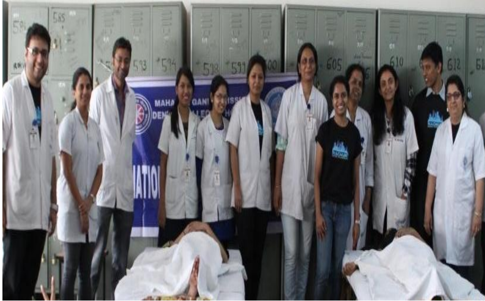
ORGANISING COMMITTEE WITH DONORS