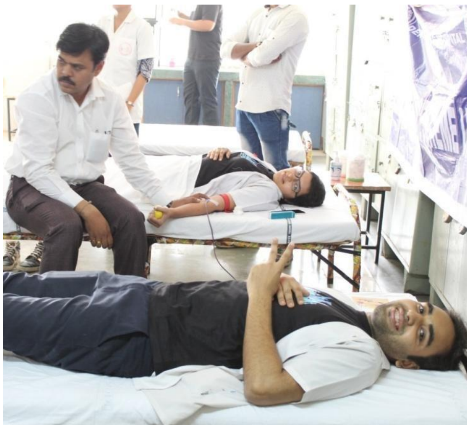
STUDENTS DONATING BLOOD