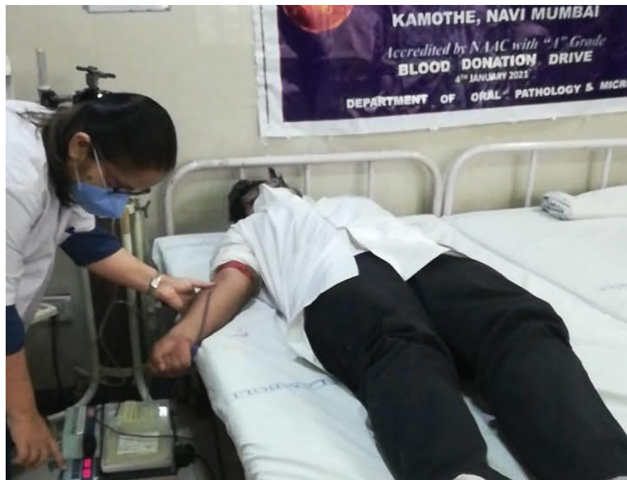
STUDENTS ACTIVELY DONATING BLOOD