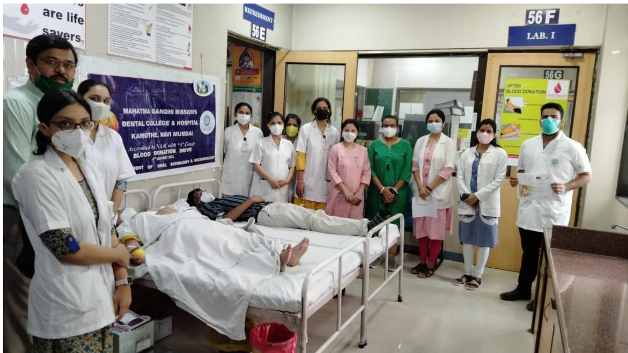
ORGANISING COMMITTEE OF BLOOD DONATION DRIVE