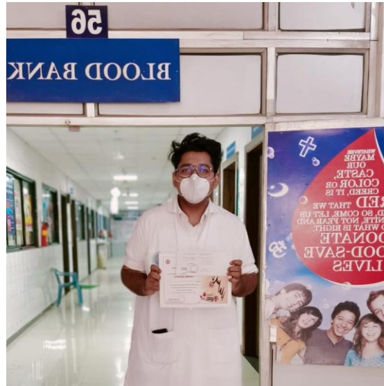
STUDENT DISPLAYING THEIR CERTIFICATES POST DONATING BLOOD