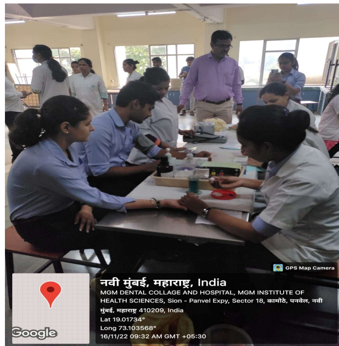
STUDENTS REGISTERING AND UNDERGOING INITIAL ASSESSMENT FOR BLOOD DONATION