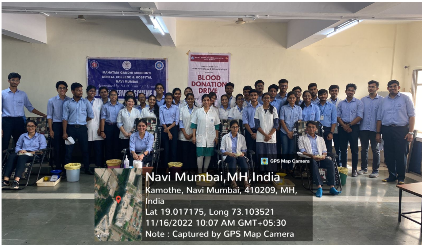
STUDENTS DONATING BLOOD

MGM DENTAL COLLEGE AND HOSPITAL, MGM INSTITUTE OF HEALTH SCIENCES, Sion - Panvel Expy, Sector 18, कामोठे, पनवेल, नवी मुंबई, महाराष्ट्र 410209, India Lat 19.017323° Long 73.103552° 16/11/22 10:22 AM GMT +05:30